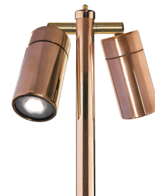
G442-LED Double Grevillea Polished copper