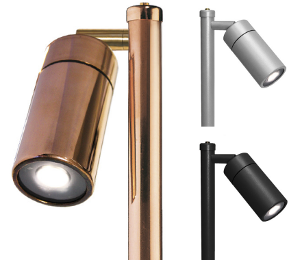
G441-LED Grevillea Polished copper

(1) Nominal power consumption using a DC power supply. Actual power consumed may vary. Power supply not included.