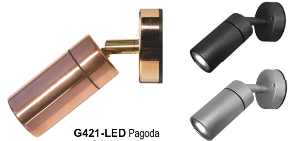
G421-LED Pagoda Polished copper

(1) Nominal power consumption using a DC power supply. Actual power consumed may vary. Power supply not included.