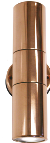
G412-LED Double Hakea Polished copper

(1) Nominal power consumption using a DC power supply. Actual power consumed may vary. Power supply not included.